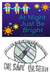
2021 Winning Designs